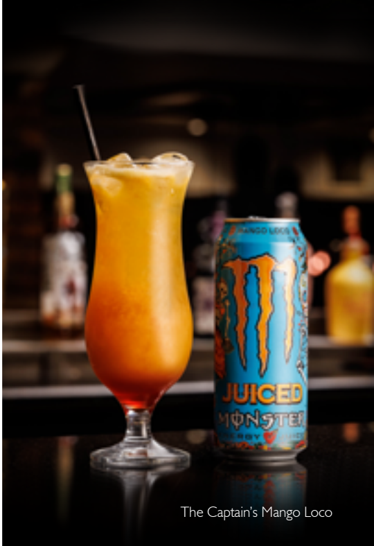
The Captain's Mango Loco

Captain Morgan's pineapple and mango rum shaken, topped with Monster Mango Loco then finished with a grenadine drizzle.